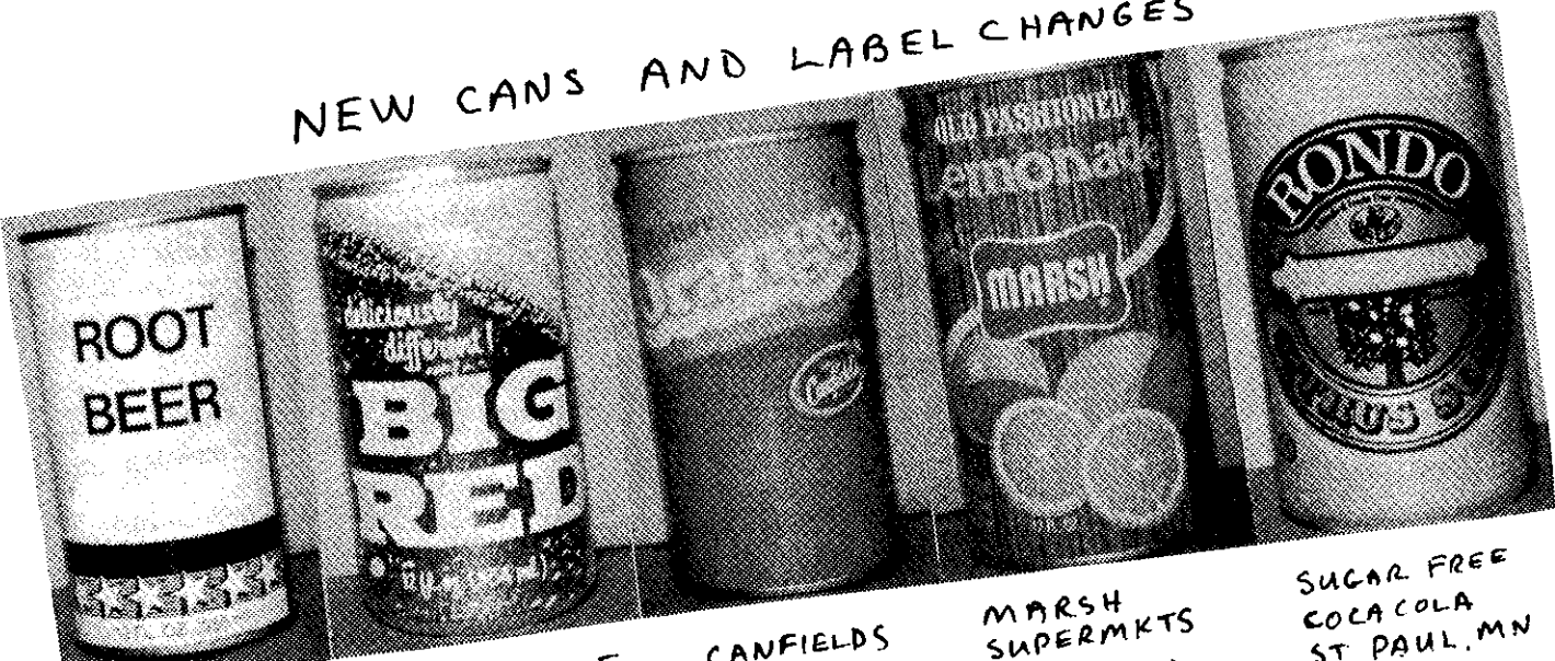
'GENERIC' FEDERATED FOODS ARLINGTON HTS ILL