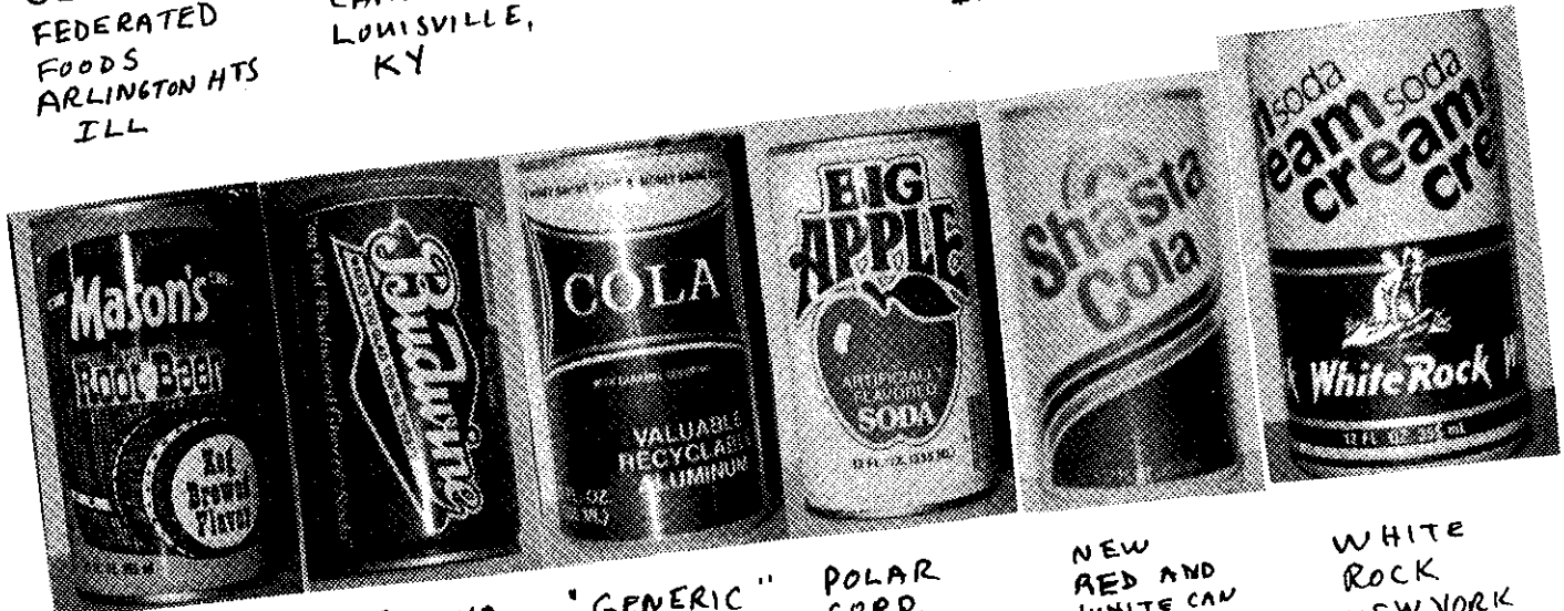
MONARCH COMPANY DORAVILLE GEO.