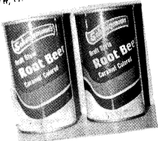
SCHWEGMANN'S SCHWEGMANN CANNED BY LASTARMECO OF ABBEVILLE, LA.