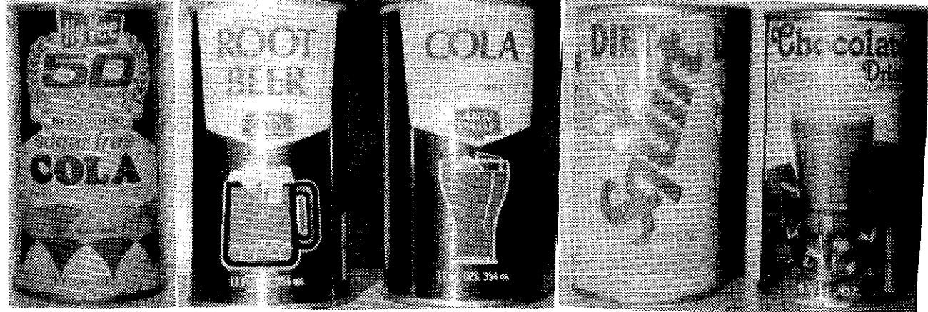
G H I J