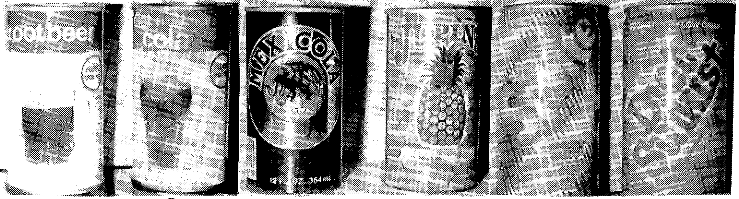
A B C D E F